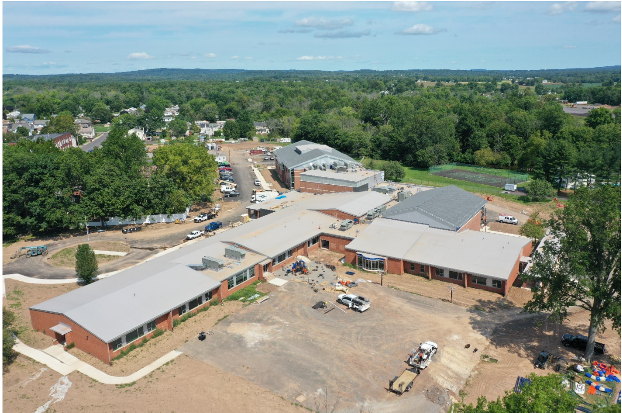
Neidig Elementary School Site, August 27, 2020