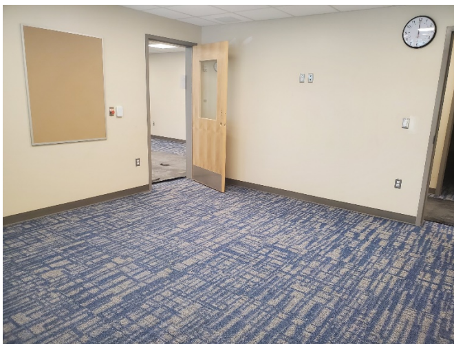
Carpet and base installed in admin suite