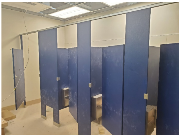
Toilet partitions in gang bathrooms