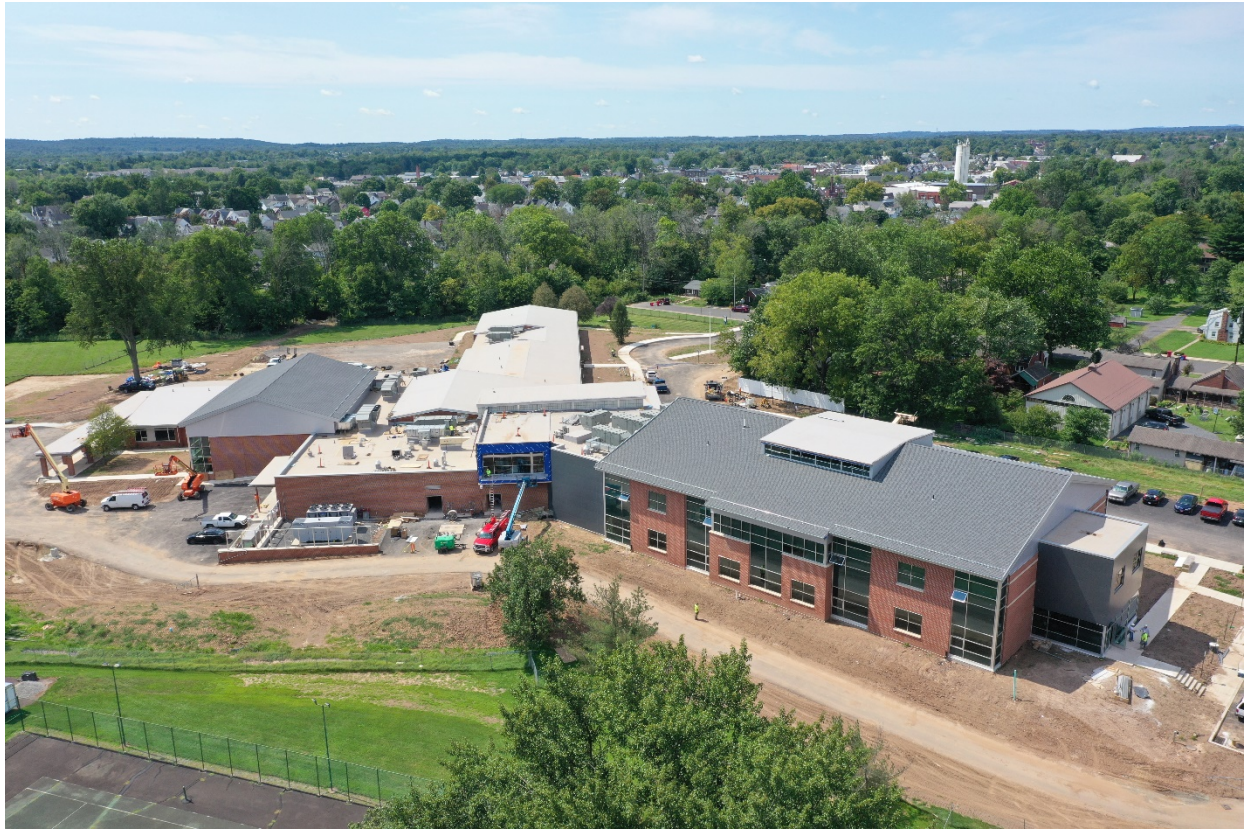
Neidig Elementary School Site, August 27, 2020