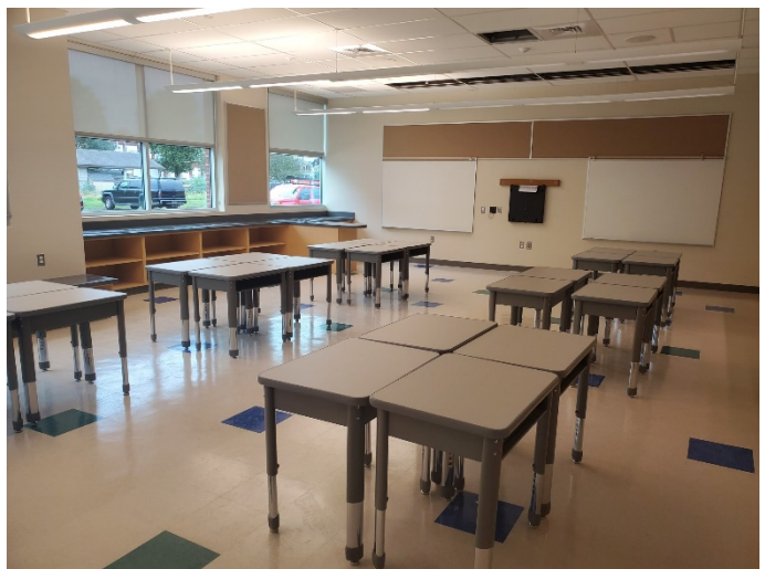
Area A classroom finishes and furniture