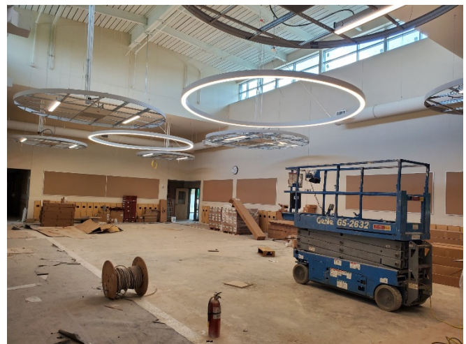
LGI ceiling clouds and lights installed