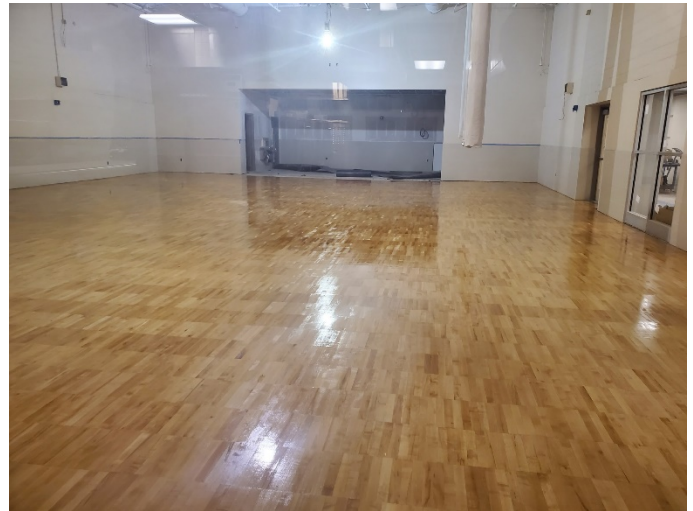
Cafeteria floor refinishing