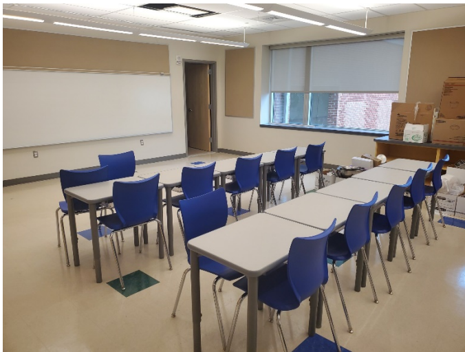
Area D classroom finishes and furniture